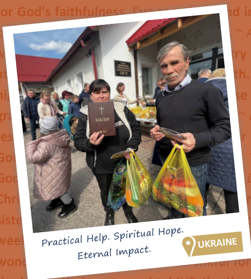
Practical Help. Spiritual Hope. Eternal Impact. UKRAINE